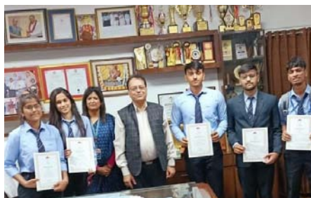
Winners of Digital Pan India awareness campaign to combat Covid-19