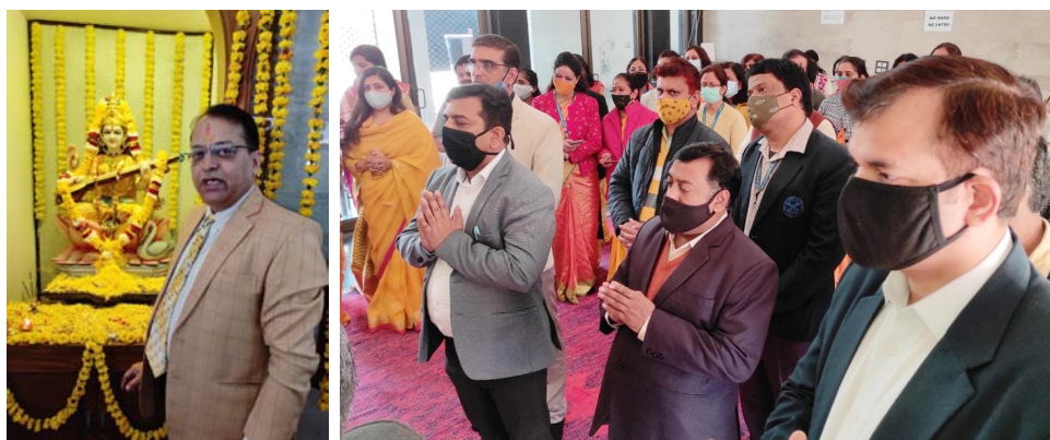
Basant Panchami Celebration

Basant Panchami was celebrated with enthusiasm on February 5, 2022. Amidst rendition of shlokas in the Saraswati Pujan, blessings for wisdom and prosperity in all dimensions was sought. There was an evident feel of 'Spring' in the air with most of the faculty members dressed up in different shades of yellow.