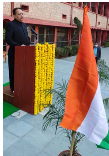
Republic Day Celebration