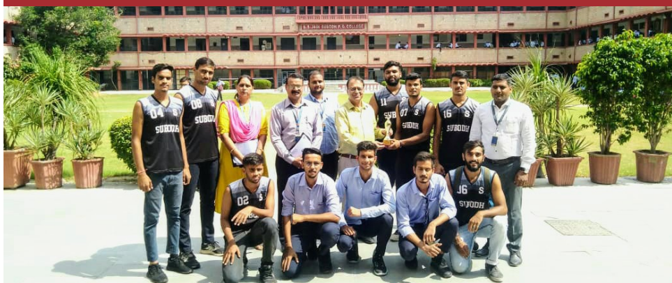
Intercollegiate Basketball Winner Team

It was a moment of immense pride and prestige when the college won the most coveted Intercollegiate Sports Tournament Trophy, for the 9th consecutive year. Our sportsmen and sportswomen won the trophy for the college by their below mentioned outstanding performance in the various sports events organized by the University of Rajasthan in the months of November-December, 2021: