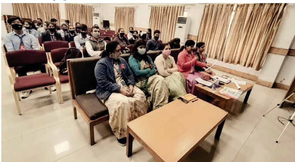
Online Interactive session on HIV, Stigma and Mother hood