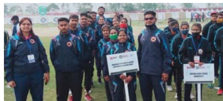
College Students in University Archery Team

The brilliantly striking performance of the college cricket team led them to secure a place in the finals of the prestigious Redbull Campus Cricket Tournament held in Chandigarh in October 2021. Our team represented Rajasthan state in this national level competition.