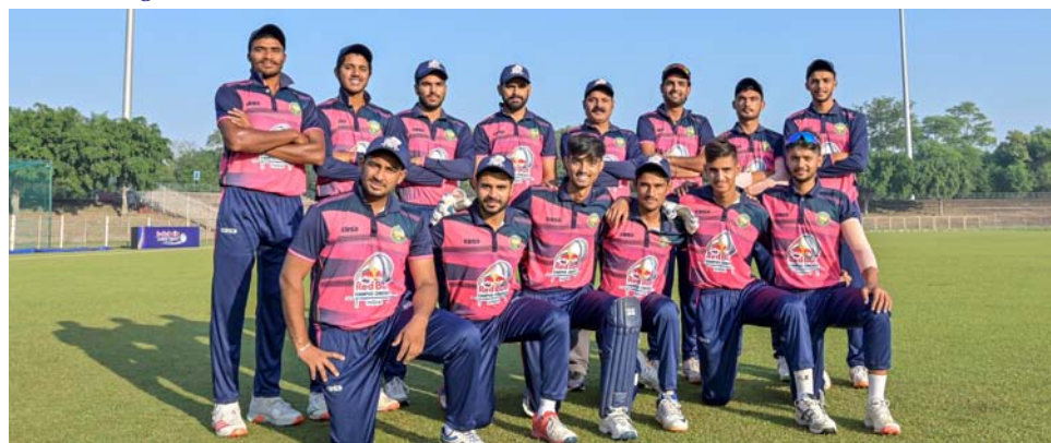
College Team in Redbull Campus Cricket Tournament

The brilliantly striking performance of the college cricket team led them to secure a place in the finals of the prestigious Redbull Campus Cricket Tournament held in Chandigarh in October 2021. Our team represented Rajasthan state in this national level competition.