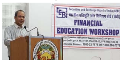
Workshop on Financial Education Awareness

An intracollege competition on Creative Cleanliness (Best out of Waste) and Hygiene Etiquettes (Poster Making) was organized in the college on December 18, 2021 under the aegis of Mahatma Gandhi National Council of Rural Education. There was an overwhelming response of the students for the competition which was evident from the number of entries received. The students displayed their creativity in the form of posters and different articles made from waste products.