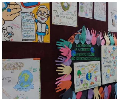
Intra-college competition on Creative Cleanliness and Hygiene Etiquettes

An intracollege competition on Creative Cleanliness (Best out of Waste) and Hygiene Etiquettes (Poster Making) was organized in the college on December 18, 2021 under the aegis of Mahatma Gandhi National Council of Rural Education. There was an overwhelming response of the students for the competition which was evident from the number of entries received. The students displayed their creativity in the form of posters and different articles made from waste products.