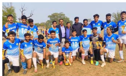
Intercollegiate Football Winner Team

It was a moment of immense pride and prestige when the college won the most coveted Intercollegiate Sports Tournament Trophy, for the 9th consecutive year. Our sportsmen and sportswomen won the trophy for the college by their below mentioned outstanding performance in the various sports events organized by the University of Rajasthan in the months of November-December, 2021: