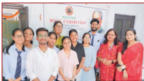
Central library, Univ. of Rajasthan