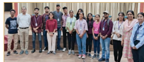
Conclave on Child and Adolescent Psychiatry

On the occasion of World Mental Health Week, Psychology department students enthusiastically participated in "Run for Mental Health" organized by "Psychiatry Centre, Sawai Man Singh Medical College" on October 8, 2023