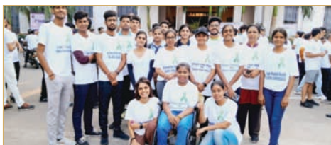
Run for Mental Health

On the occasion of World Mental Health Week, Psychology department students enthusiastically participated in "Run for Mental Health" organized by "Psychiatry Centre, Sawai Man Singh Medical College" on October 8, 2023