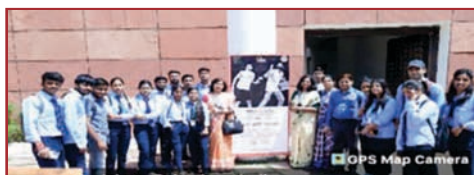
Jawahar Kala Kendra