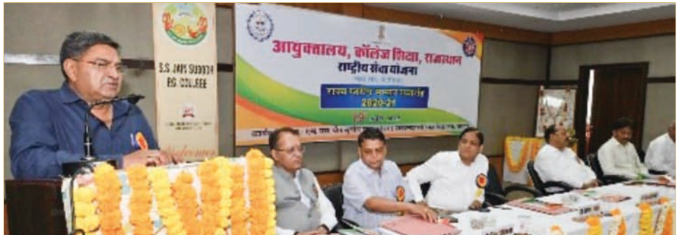
NSS Award Ceremony