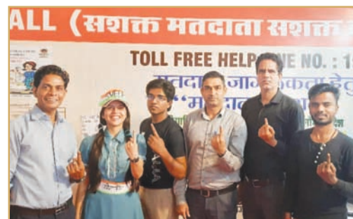
Voter Awareness Program by ECI

Students participated in National Session of Indian Youth Parliament based on the theme “Importance of Media Freedom to Democracy, Peace and Delivery on the Sustainable Development Goals” organised by the Media Foundation in association with Centre for Entrepreneurship and Skill Development, University of Rajasthan on the occasion of UN Democracy Day from September 15-17, 2023.