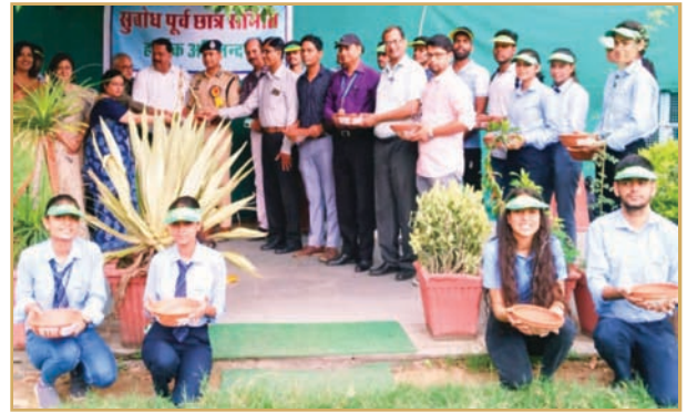
Environment and Animal Safety Awareness by "Subodh Purv Chatra Samiti"