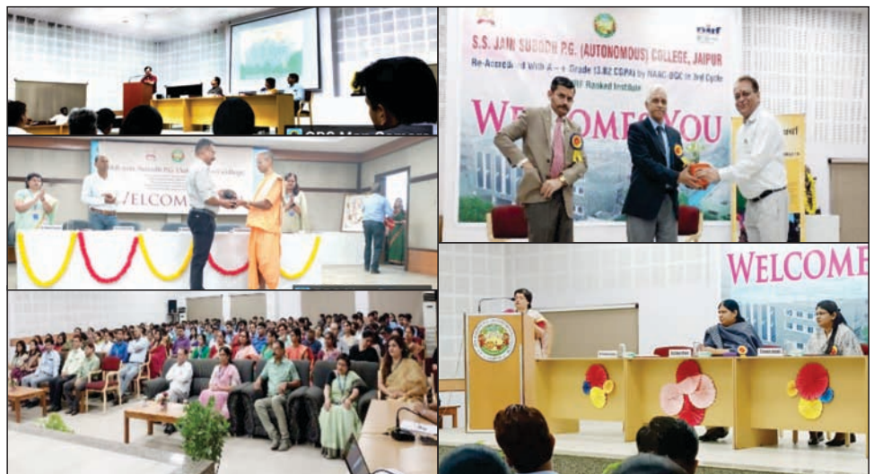
Guest Lectures, Workshops and Talk Shows