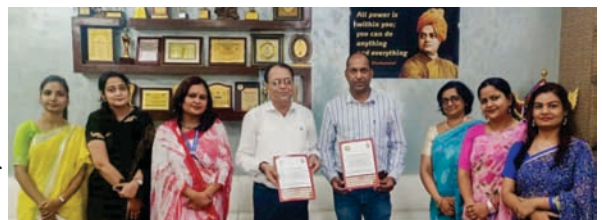
MoU Exchange with TGIBT