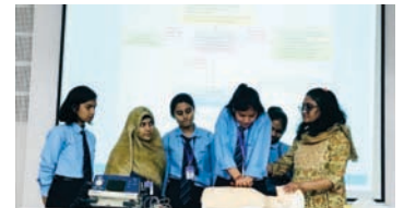
CPR Training program

Red Ribbon Club of the college organized a CPR Training program in association with Santokba Durlabhji Hospital on September 1, 2023. Dr. Swati Soni conducted the session and highlighted the importance of CPR as a life saving measure for the victims of cardiac arrest. The training intended to equip maximum number of students with these life-saving skills.