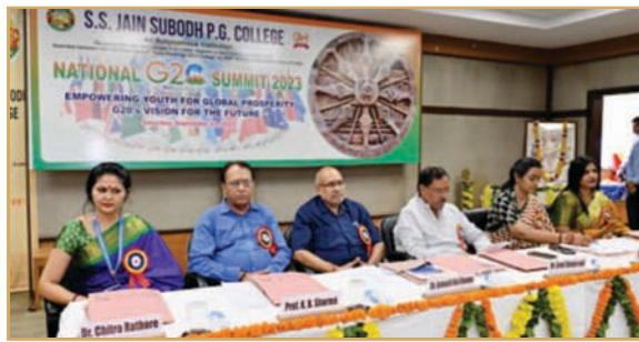
National G-20 Summit 2023