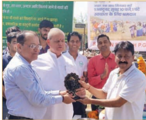
"Cleanliness is Service" Campaign