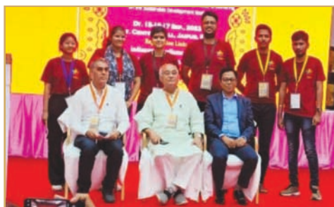
National Session of India Youth Parliament

NSS volunteers, Rangers, Rovers, NCC cadets actively participated in the voter awareness program organized by the Election Commission of India (ECI) at the Rajasthan Agriculture Research Institute Sept. 30, 2023. The program aimed to raise awareness about the importance of voting and encouraging voter participation among all sections of society. Esteemed guests, included Sh. Rajiv Kumar, Chief Election Commissioner, Sh. Anup Chandra Pandey, Election Commissioner and Sh. Arun Goel, Election Commissioner at ECI, along with District and State Icons. On October 1, 2023, a mega walkathon was also organized from Statue Circle to Amar Javan Jyoti by ECI.