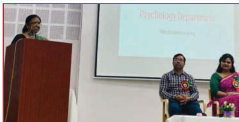
Panel Discussion on Mental Health