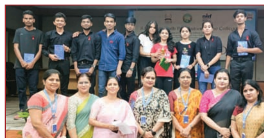
Abhivyakti : The Red Show

Red Ribbon Club of the college conducted a Drama Competition: “Abhivyakti : The Red Show” on October 5, 2023 under the aegis of Rajasthan State AIDS Control Society, as per the Guidelines of National AIDS Control Organization, New Delhi. The subject of drama competition was HIV, AIDS: Causes and Prevention Information about Misconceptions, Stigma and Discrimination. The first winning team Whispers of Resilience: Facing AIDS will represent the college at district level competition. The first winning team Whispers of Resilience : Facing AIDS will represent the college at district level competition.