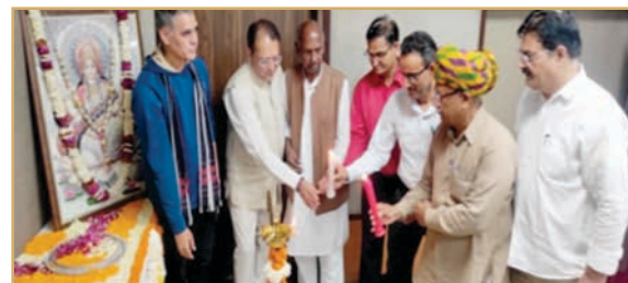
Nature Centered Development