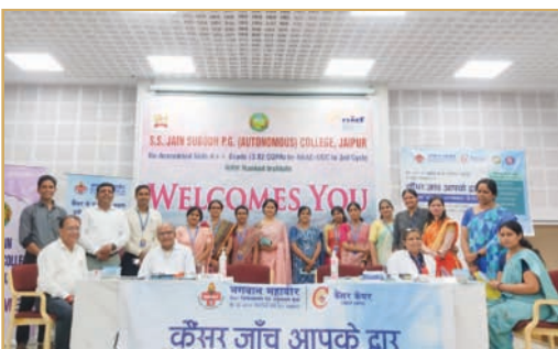
Cancer Screening and Awareness Camp