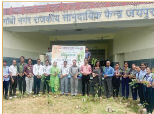
Massive Tree Plantation Programme