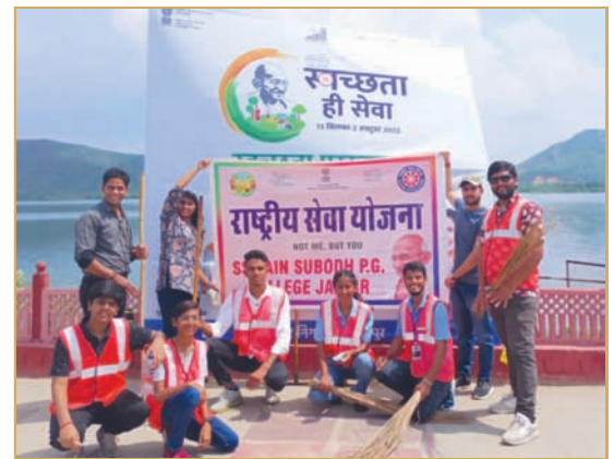
Shramdaan at Jal Mahal