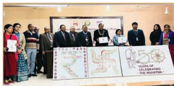
Exhibition on Historical Coins, Stamps and Autographs