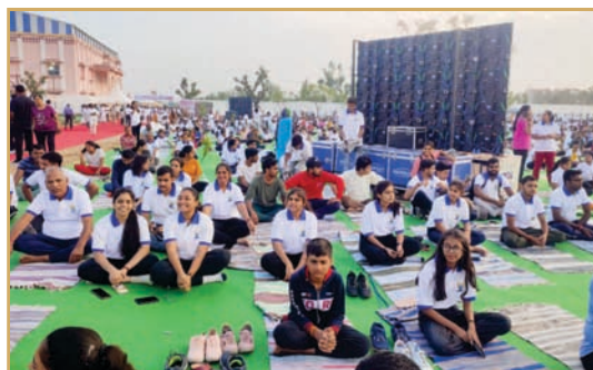
Yoga Abhyas Program

500 students of the college participated in a mass “Yoga Abhyas” program conducted under the aegis of International Yoga Day Countdown Day series, 100 days counter program to take Yoga to the masses under the leadership of Prime Minister Shri Narendra Modi. The program was organised by Morarji Desai National Institute of Yoga, Ministry of AYUSH, Govt. of India at Bhavani Niketan School, Jaipur.