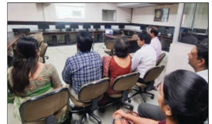
Faculty Development Programme in Computer Science Department

Department of Computer Science acted as Remote Centre for conducting one week online Faculty Development Programme on "Computer Vision Using Open CV" in collaboration with National Institute of Technical Teachers Training & Research, Chandigarh, Ministry of Education, Government of India from August 7, 2023. Another one-week online Faculty Development Programme on "Deep Learning" was organised from August 11-15, 2023. More than 50 Faculty members and 20 Research Scholars benefitted from the programme.