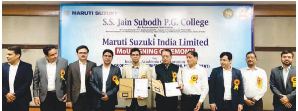
MoU Exchange with Maruti Suzuki (I) Ltd.