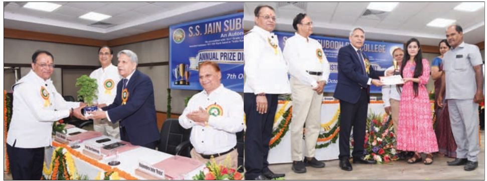
Annual Prize Distribution Ceremony