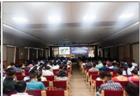
Subodhini- One Question- One Expert

Under the aegis of Subodh Shiksha Samiti, a two-day seminar “Subodhini- One Question- One Expert” was organized on July 21-22, 23 for capacity enhancement of the faculty members. All the participant faculty members presented the questions and answers through the powerpoint presentation in a well-defined pattern, mentioning the objective of the question, its probable answer, the references from which the answer has been derived and the way the questions can be further improvised.