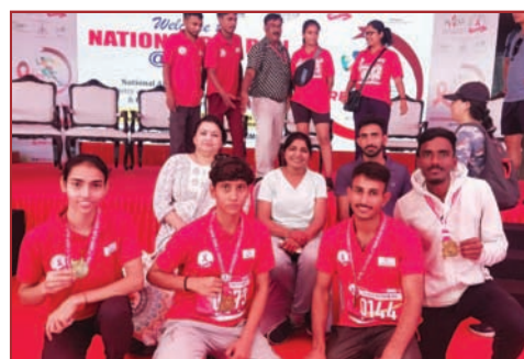
Winners of Red Run Competition