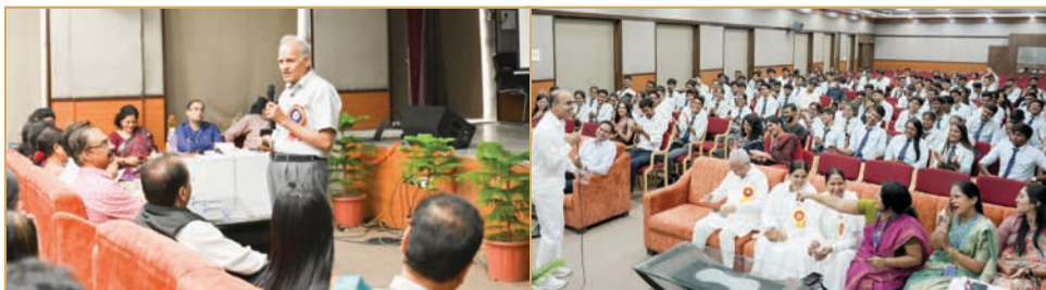
Orientation Programme for new comer students

• "Study of Physicochemical Activity of Jal Mahal Lake" in International Journal of Science and Research, Vol 12 (7), July 2023, 1408-1410.