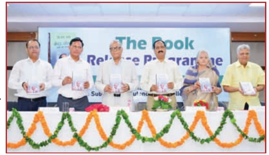
Book Release Programme