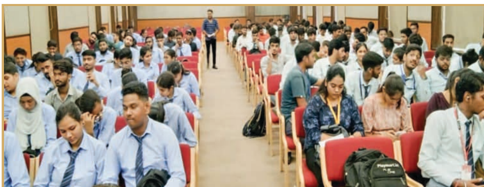
Campus Placement Drive