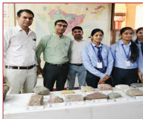
Geological Survey of India Museum