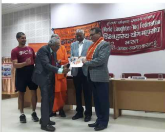
Laughter Yoga Programme -Hasyotsav