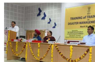
Training of Trainers (ToT) on Disaster Management and Youth

Chemistry department organized an event "FUN FEST" on 26 th March 2018 in college campus. The purpose of this event was to provide a platform for students to showcase their abilities in various fields. Activities like Scientific Rangoli, Treasure Hunt, Quiz, Dumb Charade were the main attractions. Around 200 students participated in these activities enthusiastically. A three day Training of Trainers programme on Disaster Management and Youth was organized from 26 th March to 28 th March 2018 in college campus under the sponsorship of Rajiv Gandhi National Institute of Youth development ( RGNID), Sriperumbudur, Tamilnadu, an Institute functional under the Ministry of Youth affairs and Sports, Govt. of India. Eminent speakers and delegates from all over the country attended the programme.