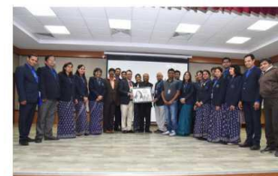
Technitude - 2018