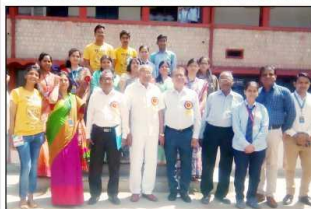
Fun Fest -2018

Chemistry department organized an event "FUN FEST" on 26 th March 2018 in college campus. The purpose of this event was to provide a platform for students to showcase their abilities in various fields. Activities like Scientific Rangoli, Treasure Hunt, Quiz, Dumb Charade were the main attractions. Around 200 students participated in these activities enthusiastically. A three day Training of Trainers programme on Disaster Management and Youth was organized from 26 th March to 28 th March 2018 in college campus under the sponsorship of Rajiv Gandhi National Institute of Youth development ( RGNID), Sriperumbudur, Tamilnadu, an Institute functional under the Ministry of Youth affairs and Sports, Govt. of India. Eminent speakers and delegates from all over the country attended the programme.