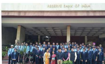
Visit to Reserve Bank of India

An interactive session for the students was organized by the Chemistry Department in the month of February, 2018. The participants included both undergraduate and post graduate Science students. They were shown videos on simple principles of science and were asked questions related to them in the end.