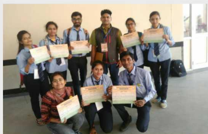
Winner Team of Quiz and Science Role Play Competition