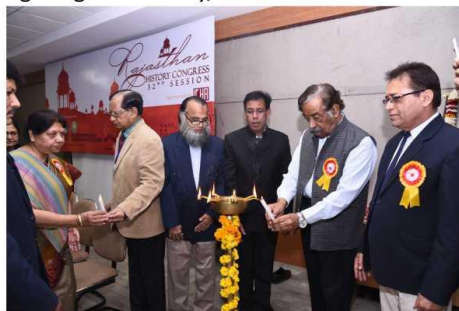
National Conference of Rajasthan History Congress (32 nd Session)