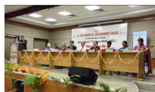
National Science Day 2018

On the occasion of National Science Day on 28 th February 2018, all the departments of Science organized an event on the theme "Science and Technology for Sustainable Future".