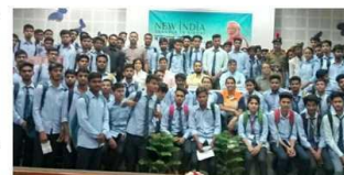
Sankalp se Siddhi