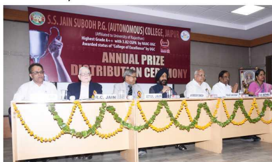
Annual Prize Distribution Ceremony