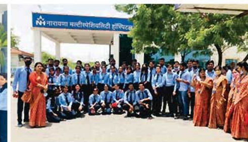
On the occasion of "World No Tobacco Day" Red Ribbon Club units visited Narayana Multi-speciality hospital's Oncology department on May 31, 2022.