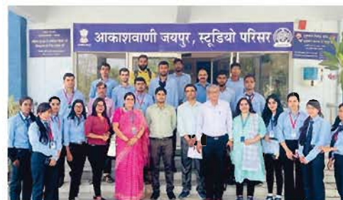
Department of Journalism and Mass Communication visited Akashwani Kendra, Jaipur on April 26, 2022.