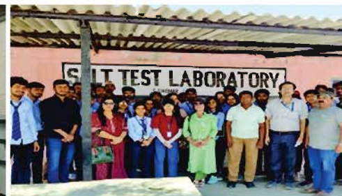
Department of Chemistry visited Sambhar Salt Limited on April 1, 2022,