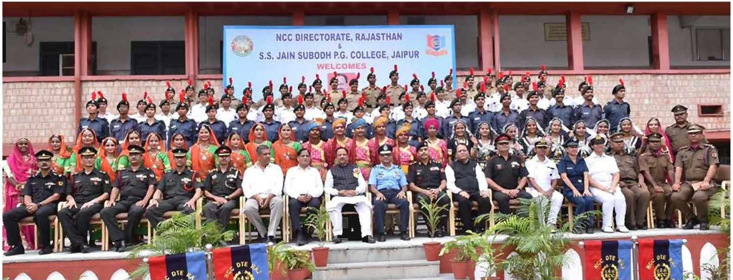
Visit of Shri Ajay Bhatt, State Defence Minister (Raksha Rajya Mantri) on September 13, 2022 for the felicitation of exemplary piece of work performed by NCC cadets in various fields of consideration