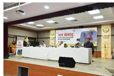
Jan Samvaad programme