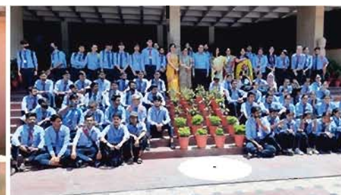
Department of E.A.F.M and Economics visited RBI, Jaipur on April 28, 2022.