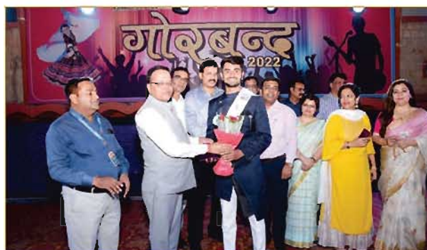
Cultural Fest- Gorbandh