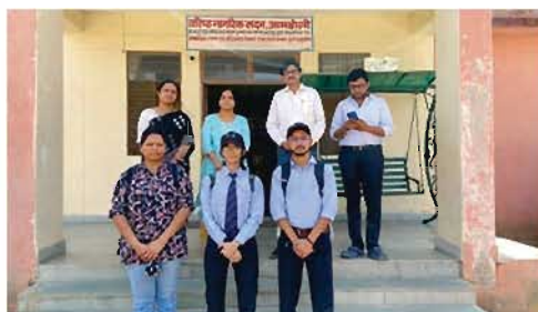
The Department of Social Work visited Apna Ghar NGO, on April 13, 2022.