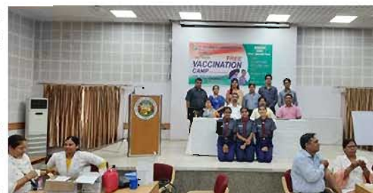
COVID Vaccination Camp (Booster Dose)