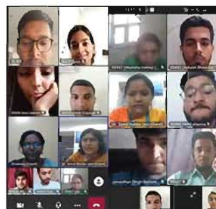
Training cum Placement Programme

Twelve volunteers of NSS have represented Rajasthan in Raipur, National Integration Camp. The camp was organized from May 21 to 27, 2022 at Pandit Ravi Shankar Shukla University, Raipur, Chhattisgarh by the Ministry of Youth Affairs and Sports, Government of India. About 15 state volunteers participated and displayed their art and culture.