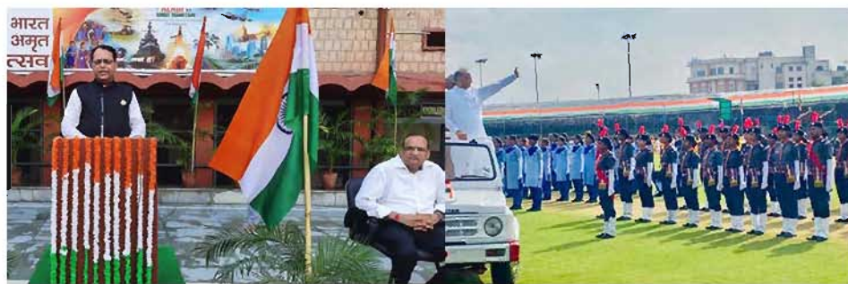
Independence Day celebration in the college campus on August 15