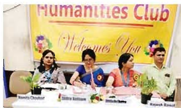
Poetry Recitation Competition