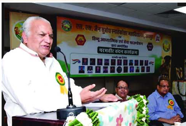
Paramveer Vandan Programme

• Sulfur coated graphene for cathode in lithium batteries" from SERB DST under TARE scheme.