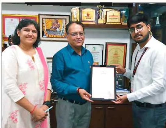
MoU with ICT Academy

संस्कृति एक सुकृति है, जो एक सार्वभौमिक शिक्षित समाज का दर्पण है। शिक्षक, एक सुसंस्कृत समाज की धुरी है, एक नींव की ईंट है, जो कि हमारे नौनिहालों की शिक्षा की आधारशिला रखता है। मानव जीवन एक समदर्शिका है, जो निरंतर विचारों को निशपादित कर उनका अदान-प्रदान करता है। उदाहरणार्थ देखा जाए तो युद्ध मानव-मस्तिष्क की उपज है, ये एक सर्वभौमिक सत्य है। हमें ऐसे ही घातक परिणामों को परास्त करते हुए, एक प्रशस्त प्रगति के मार्ग पर चलने के लिए प्रेरित करता है। शिक्षा के माध्यम से ही हम सभी प्रकार के दिग्भ्रमों को दूर कर सकते हैं। शिक्षक हमारे मार्गदर्शक हैं, पथप्रदर्शक हैं, जो शिक्षा के माध्यम से छात्रों को सुसंस्कारित करने में सक्षम हैं। यह हमारी आने वाली नवीन संस्कृति का समागम है। और यही सुबोध की उत्पत्ति है, उद्बोधिका है। इसके लिए सभी का सामंजस्य अति अनिवार्य है। आज समय अनेकानेक मिथ्यों का साक्षी है, जो हमारी युवा पीढ़ी को अतिभौतिक सुख सुविधाओं की और अग्रसर कर रहा है। विकास और नवीनीकरण परम आवश्यक है, परन्तु वह सतत होना चाहिए। क्षेत्र चाहे, शिक्षा का हो, पारिवारिक हो, व्यावसायिक हो, या पर्यावरणीय हो, सभी को एक समग्र सतत विकास की आवश्यकता है। शिक्षा ही संस्कारों की जननी है, जो हमारे समाज की परिचायक है। सत् विचारों का नवीनीकरण व निरंतर आदान प्रदान अति आवश्यक है। यही एक सुनियोजित रणनीति है, जो आने वाले समय का साक्ष्य है। शिक्षक द्वारा शिक्षा, उसके अनुरूप सद्ज्ञान द्वारा सुबोध का भाव व तटस्थ सृजन से एक सुसंस्कृति का निर्माण ही हमारा सतत विकास का सोपान है।