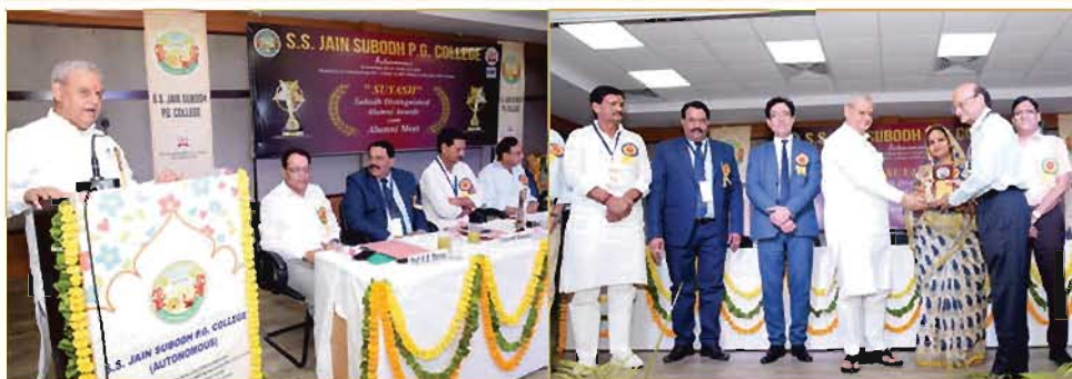
Suyash- Subodh Distinguished Alumni Awards 2022