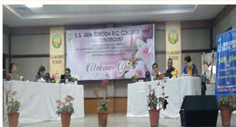
Talk Show on World Consumer Rights Day