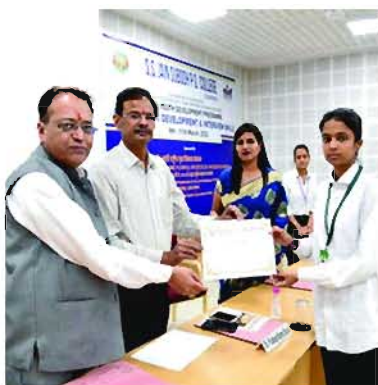
Youth Development Programme on "Personality Development and Interview Skills"