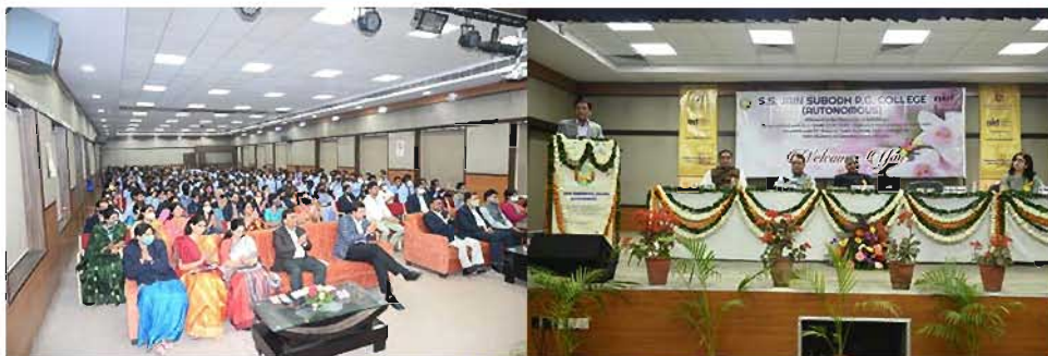
National Science Day- 2022