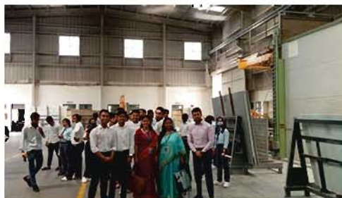
Department of B.B.A visited R.K Marbles, Ajmer, followed by Greenland Water Park on April 23, 2022.