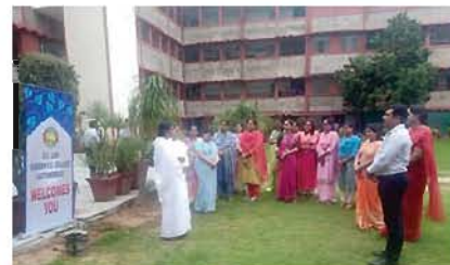
Tree Plantation programme

On July 29, 2022, under the aegis of Prajapita Brahmakumari Ishwariya Vishwavidyalaya , a tree plantation program was organized under the campaign Kalpataru . About 50 saplings were planted in the college campus, showing awareness about environmental protection through meditation. All the faculty members & students enthusiastically participated in the program and uploaded the picture of planting on Kalpataruh App of Government of India showing their interest in the awareness campaign.